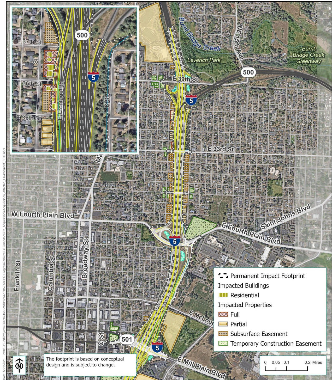
Figure B-8. Property Impacts – Upper Vancouver

Date: 5/21/2025 Path: L:\Port\Projects\Clients\1505-WSP\274-1955-058 IBR Program\05\Swes\GIS\mapdocs\Ph_Acquisitions\Acquisitions Affected Environment_FIS.aprx