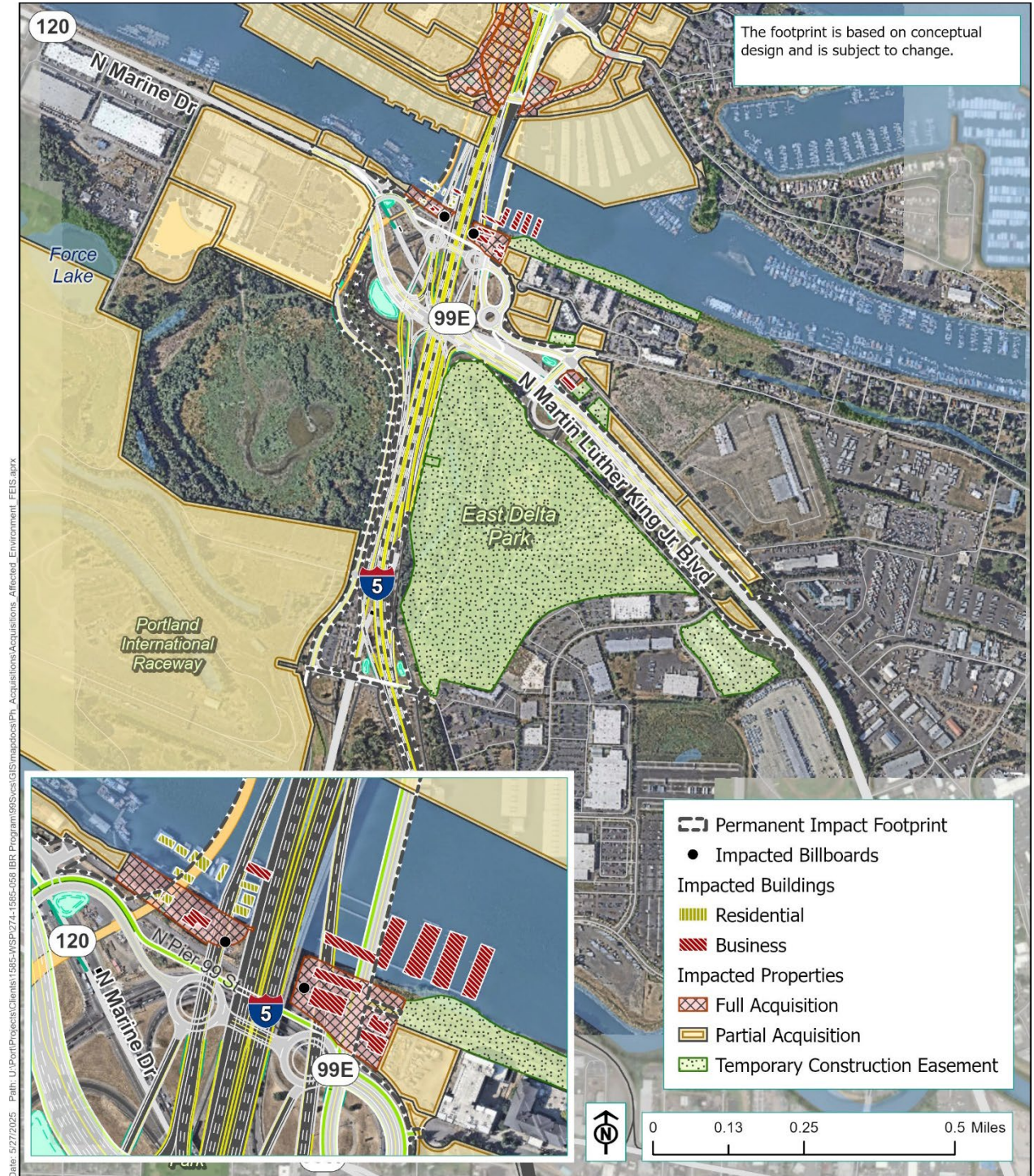
Figure B-1. Property Impacts – Oregon Mainland