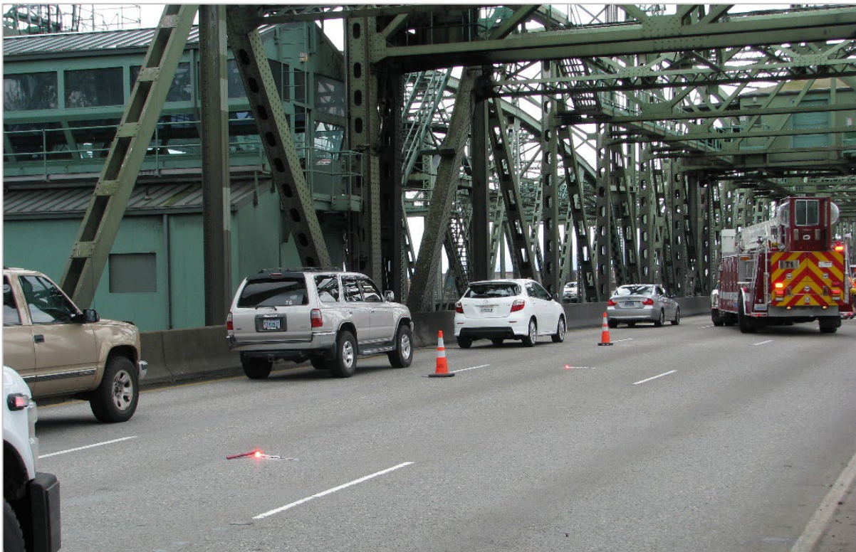
Figure 1-2. Crash Blocking the Interstate Bridge

There were seven fatal crashes in the Program area between 2015 and 2019.