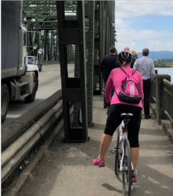
Figure 1-3. Bicycle and Pedestrian Path on the Interstate Bridge

The bicycle/pedestrian lanes on the Interstate Bridge are about 3.5 to 4 feet wide, narrower than the 10-foot standard, and are located extremely close to traffic lanes, thus impacting safety for pedestrians and bicyclists (Figure 1-3). Direct pedestrian and bicycle connectivity are poor in the Program area.